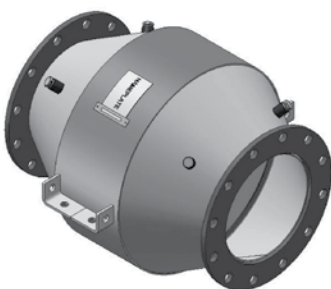
Standard Welded Design